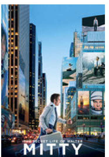
The Secret Life of Walter Dhoom: 3